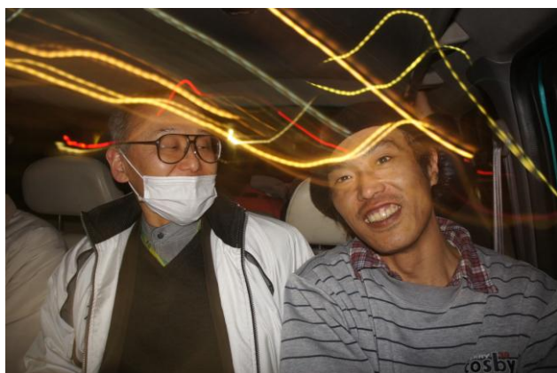
<The survivor joins his colleagues>