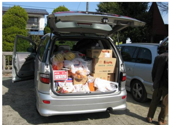
<Relief food & goods>